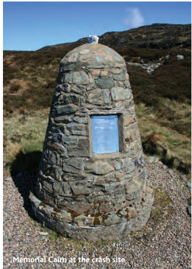
Memorial Cairn at the crash site

The four dead crew members were all special forces aircrew.