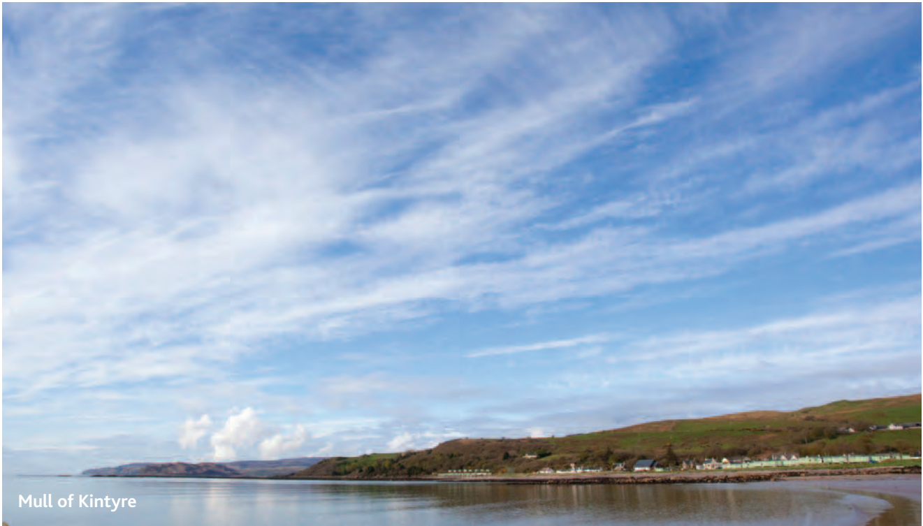
Mull of Kintyre

At the time, RUC Chief Constable Sir Hugh Annesley spoke about his officers' bravery and the lives they saved.